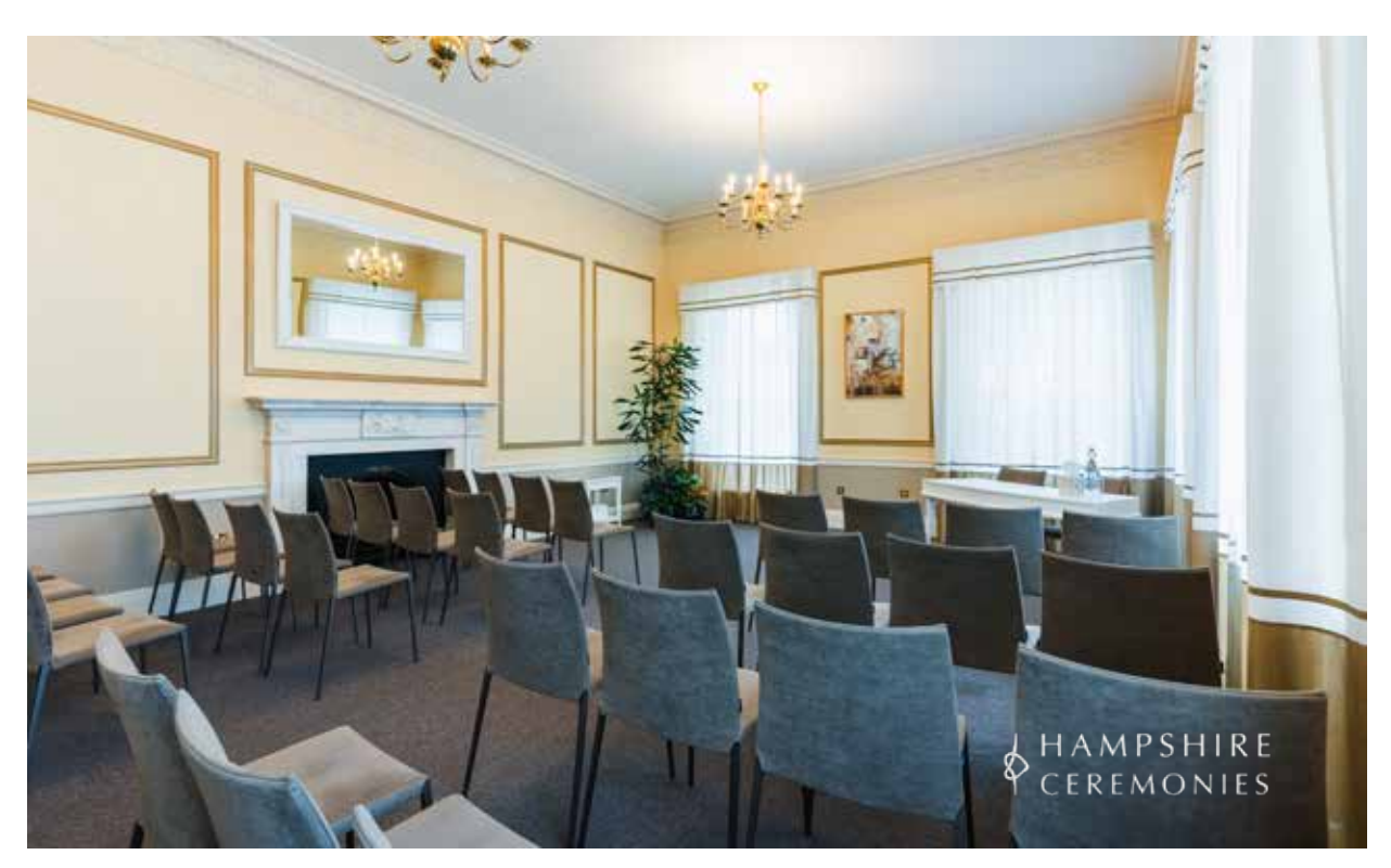
Basingstoke Registry Office

The War Memorial Park which is within walking distance has beautiful locations for your memorable photographs.